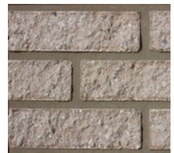
Sand Stone 571-R