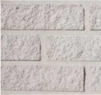
Arctic White 501-R