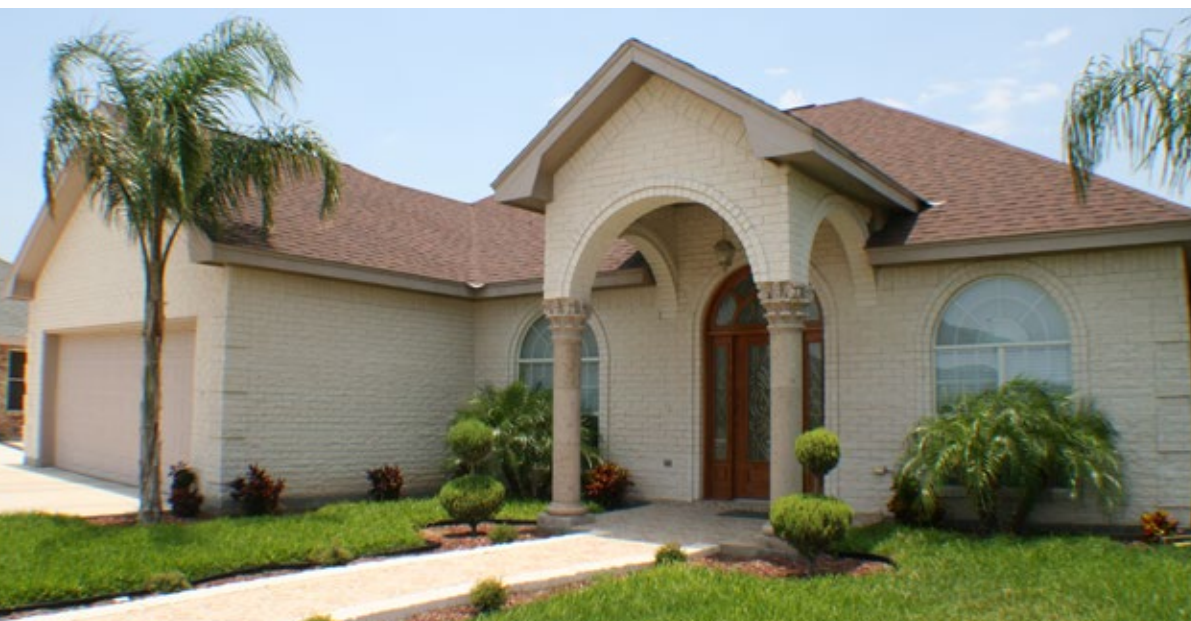
591- R, Ivory