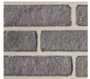
Steel Gray 591-DR