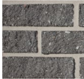
Slate Gray 521-R