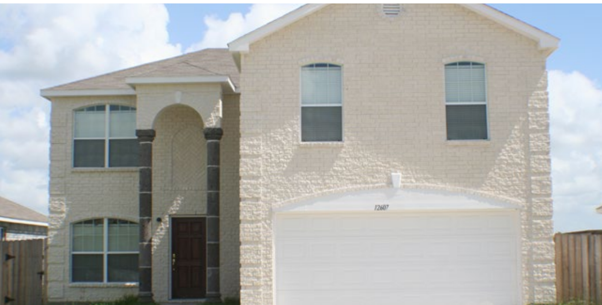
561- R, Light Buff