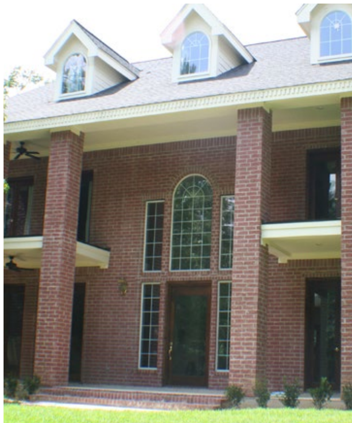
541- R, Fuego