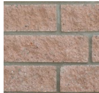
Walnut Brown 531-R