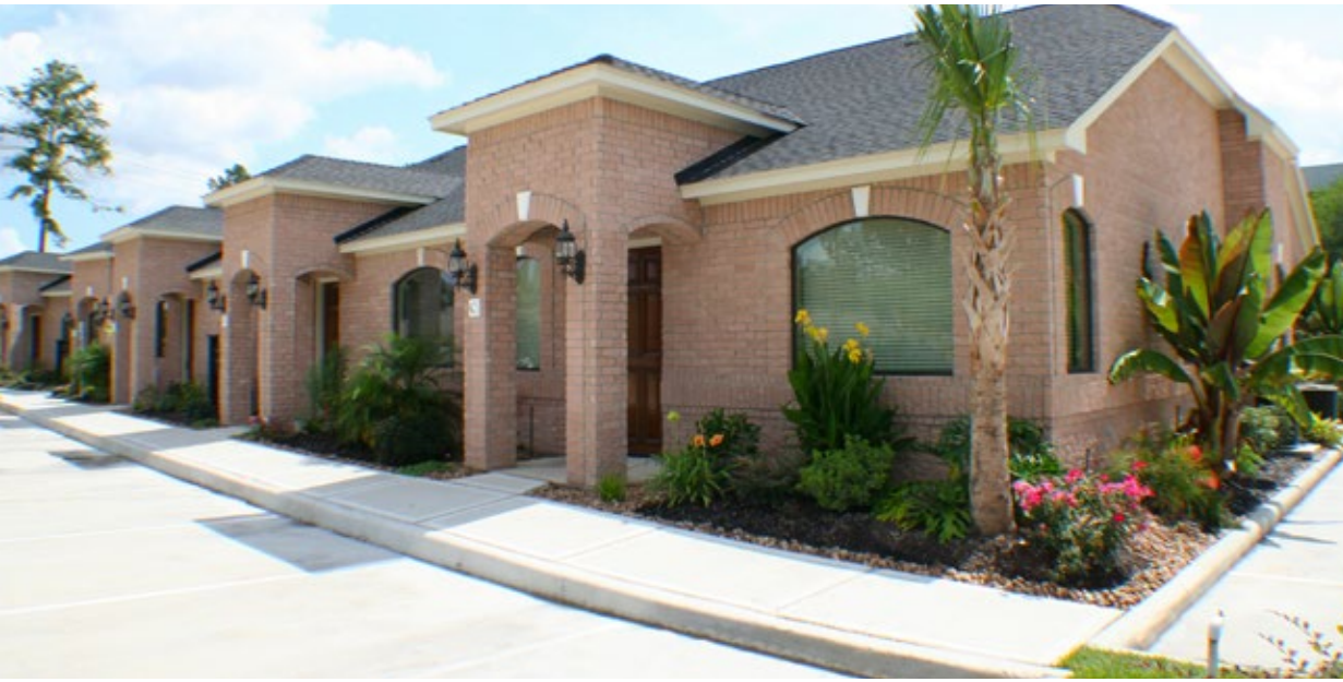
531- R, Walnut Brown