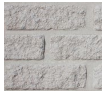
Arctic White Tumbled 501-RT