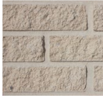
Light Buff 561-R