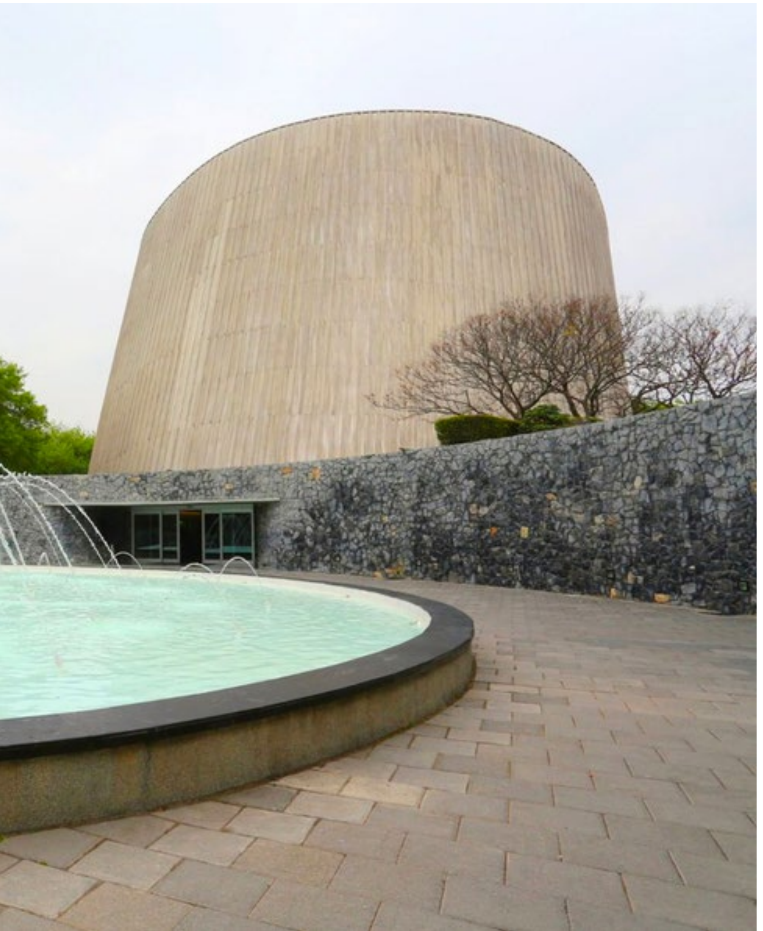
Alfa Planetarium, MX