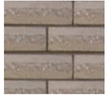
Sand Stone 171