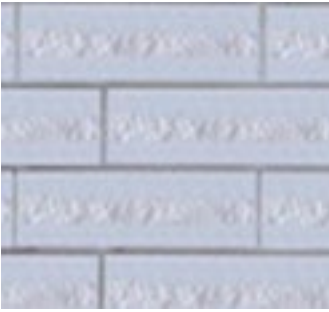
Artic White 101