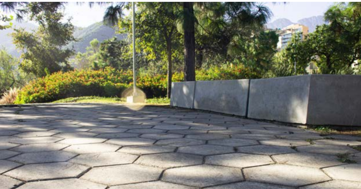
Rufino Tamayo Park, MX