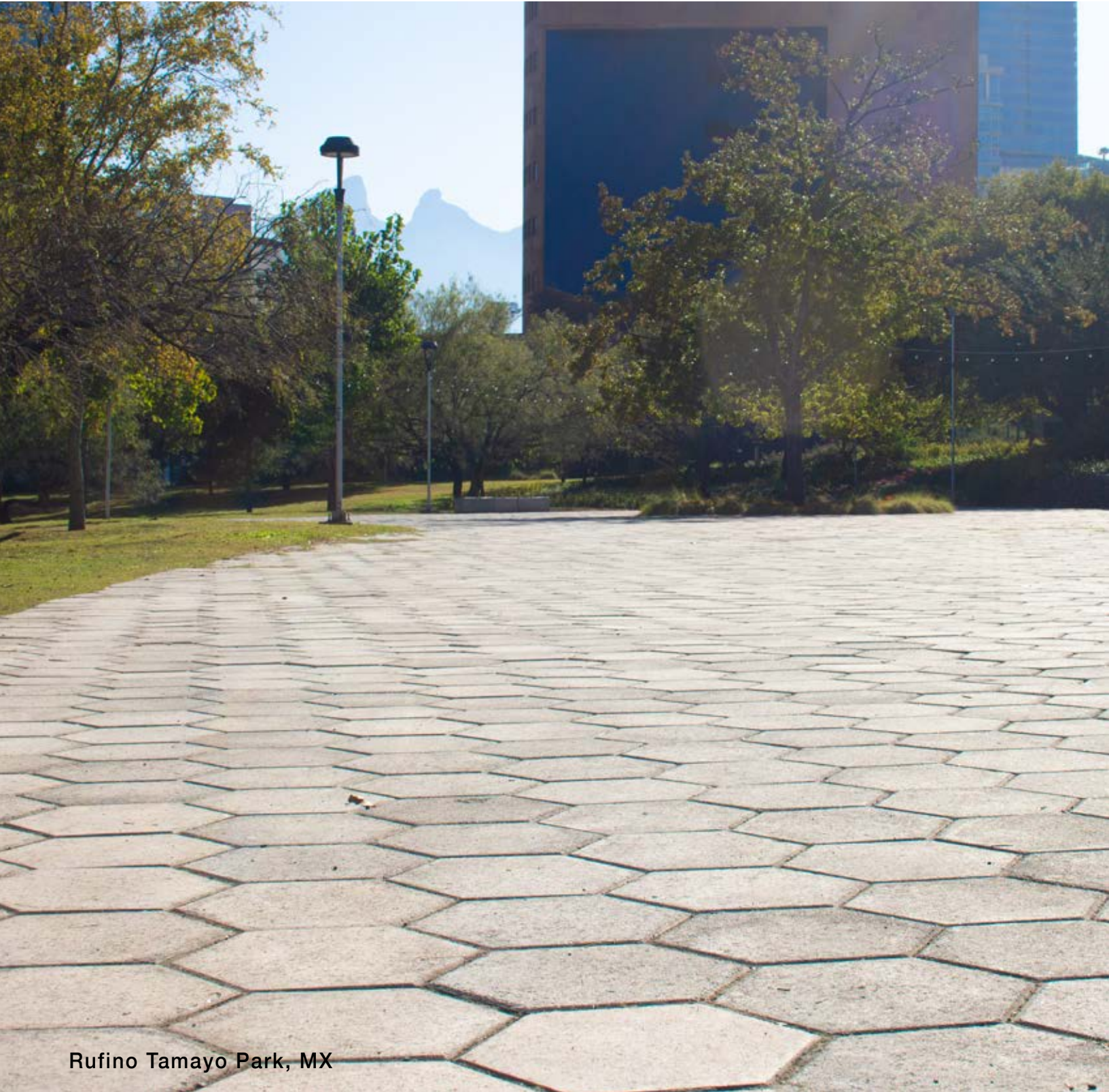
Rufino Tamayo Park, MX