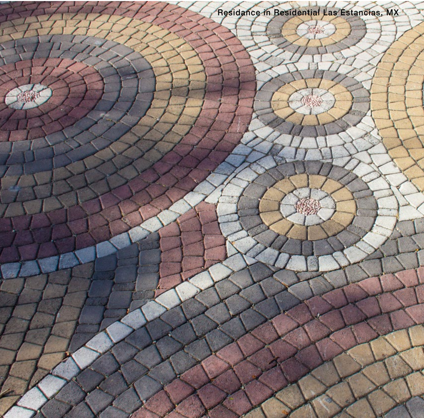
Residence in Residential Las Estancias, MX