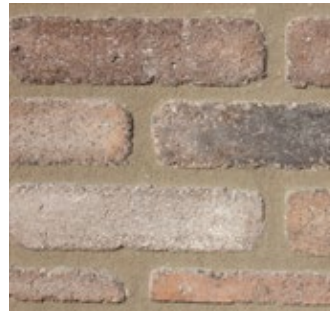
San Marcos 235-AT, 335-AT