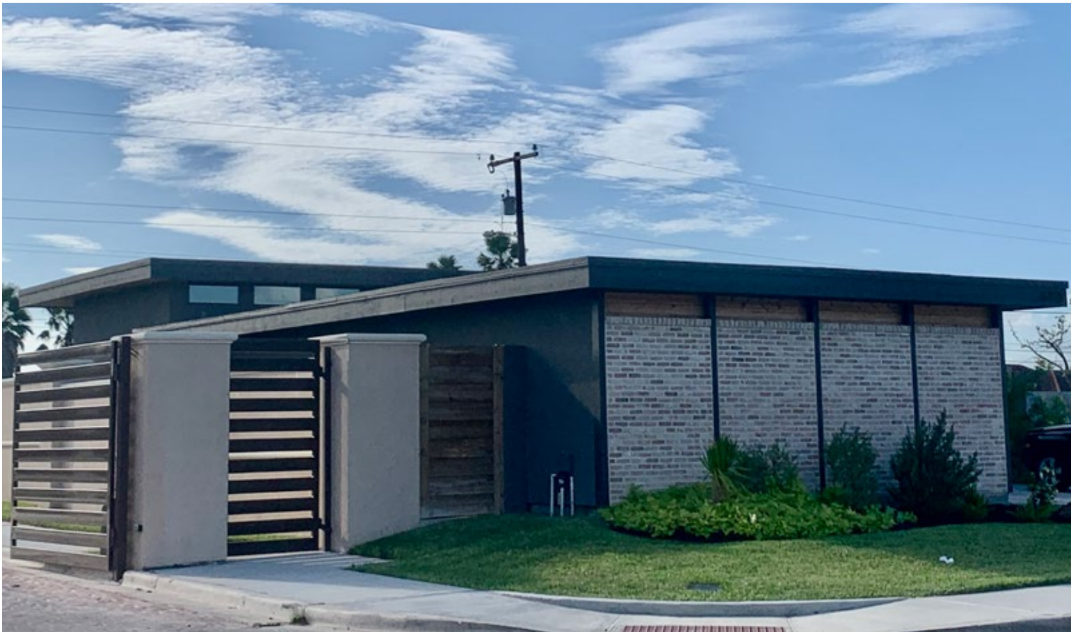
313P-T, New Orleans