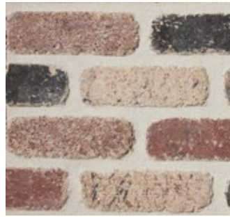
Old Amherst 268P-T, 368P-T