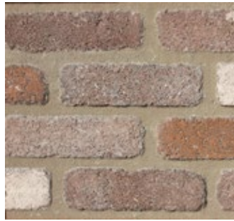
Vintage Sedona 251P-T, 351P-T