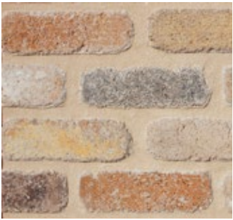
New Orleans 213P-T, 313P-T