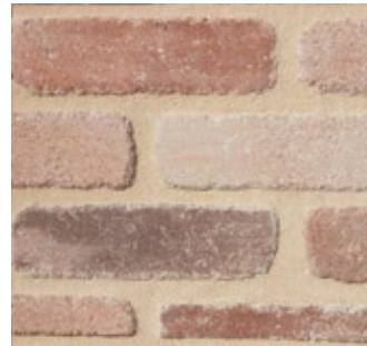
Santa Fe 263-AT, 363-AT