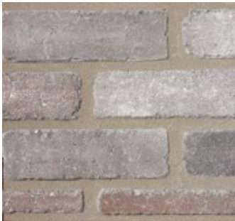
Waterloo 221-AT, 321-AT