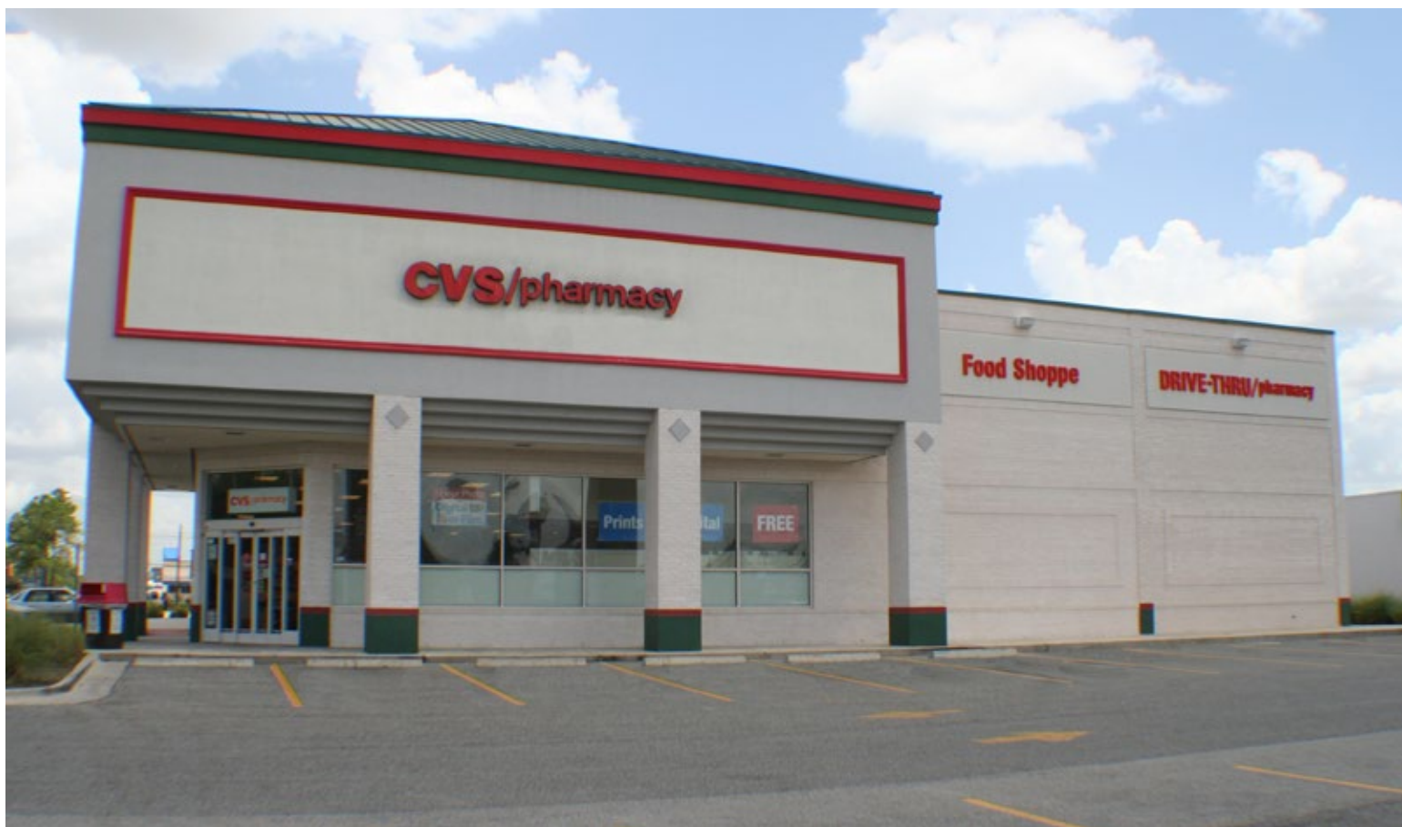
313P-T, New Orleans