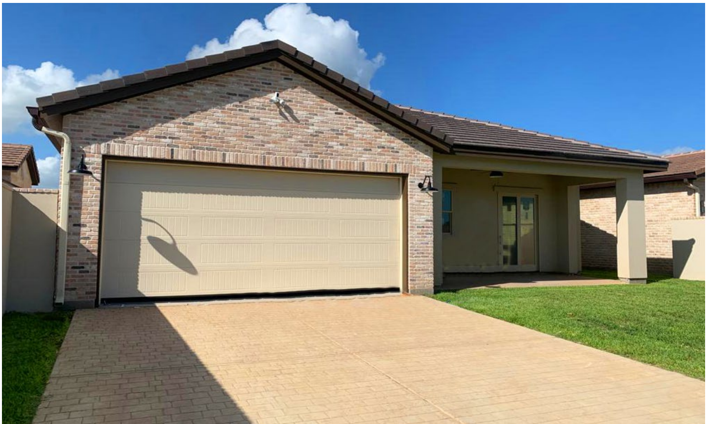
313P-T, New Orleans