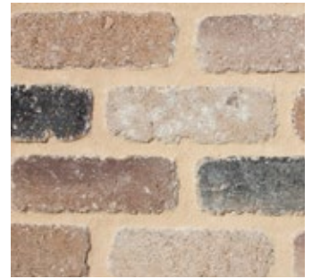
Vintage Tacoma 273-AT, 373-AT