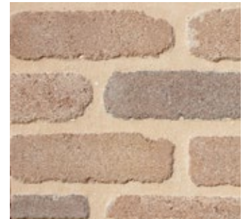
Vintage Old San Luis 2617-A, 3617-A