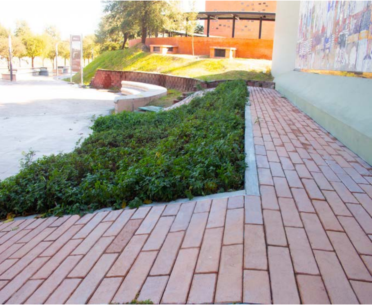
Paseo Santa Lucía Boardwalk, MX