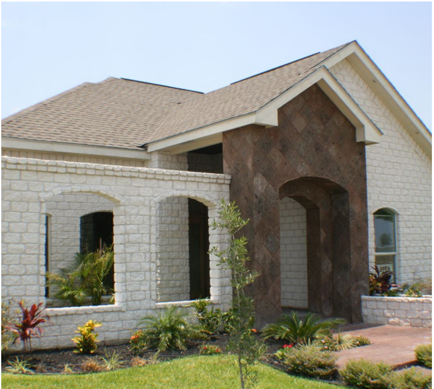
1001-RT, White Stone Tumbling