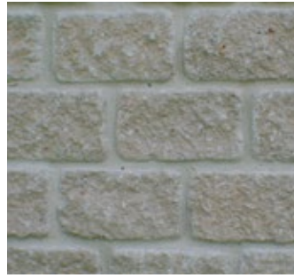
Adobe Stone Tumbling 1013-RT