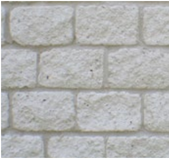
White Stone Tumbling 1001-RT