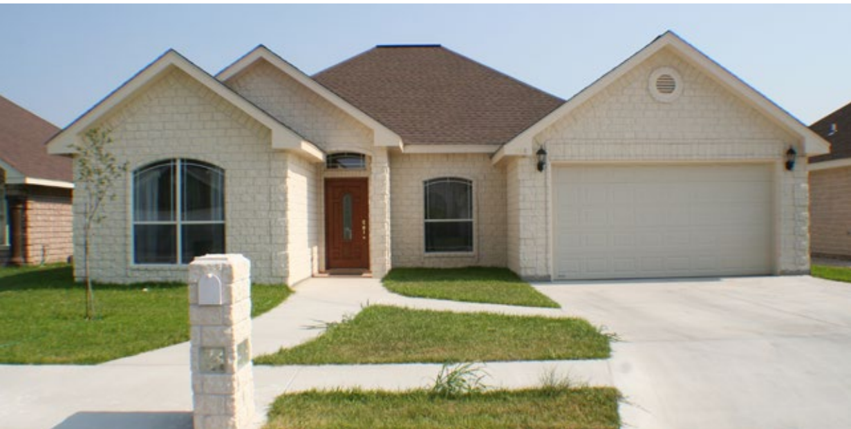
1061-RT, Light Buff Stone Tumbling