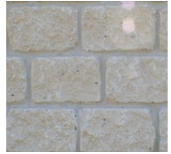
White Desert Stone Tumbling 1091-RT