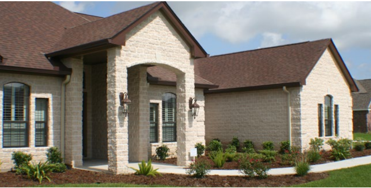
1013-RT, Adobe Stone Tumbling