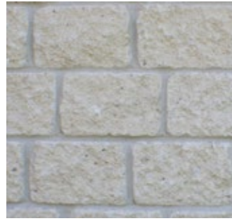
Lite Buff Stone Tumbling 1061-RT