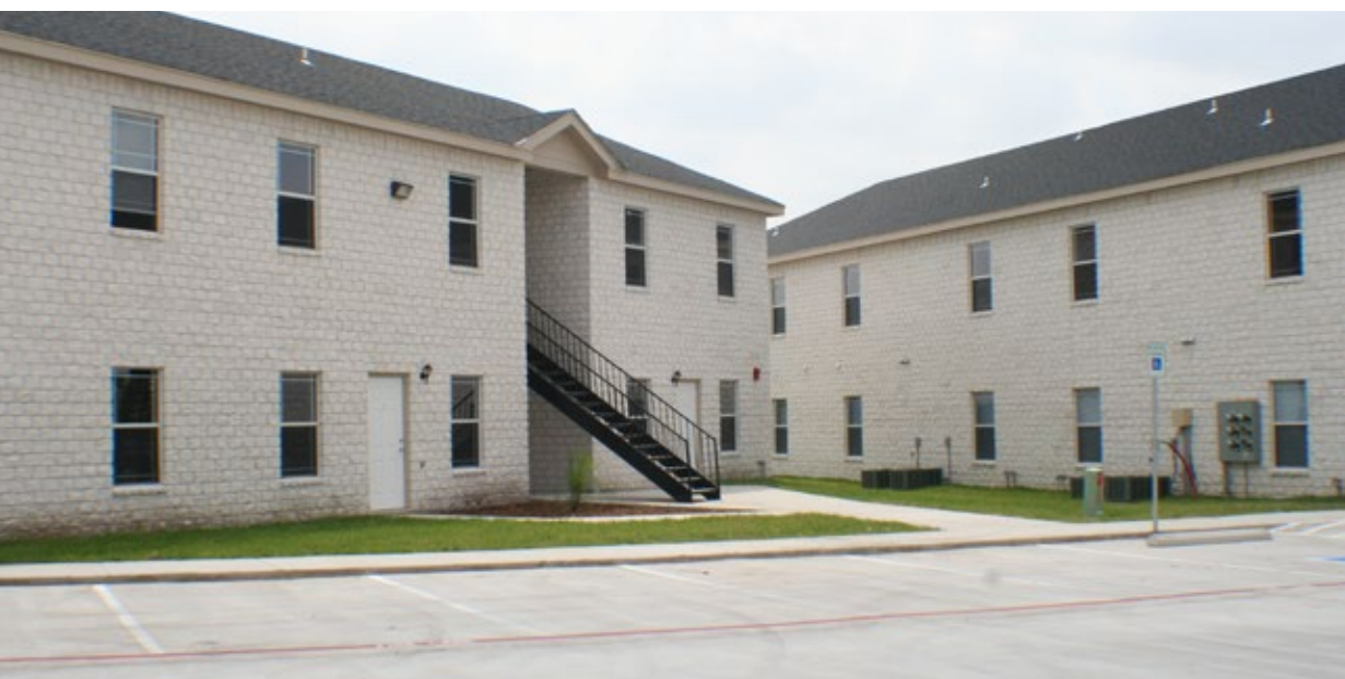
1001-RT, White Stone Tumbling